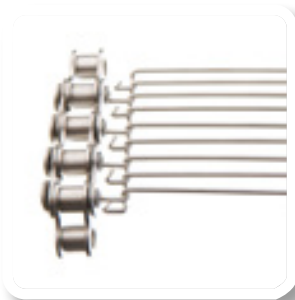
Rod network belt with guide chain, inserted mesh pitch 6.40 mm