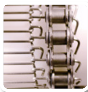
Rod network belt with guide chain, here with bent loop