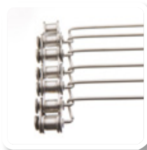
Rod network belt with guide chain, inserted mesh pitch 12.80 mm